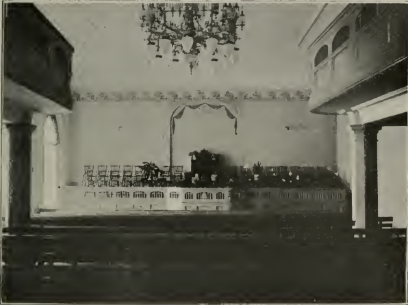
INTERIOR OF THE STOCKHOLM MISSION HOUSE, LOOKING FROM THE GALLERY.